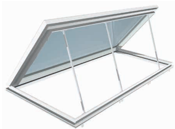
3D illustration of an open VENTRIA 3 flap

1) Other dimensions and weights upon request