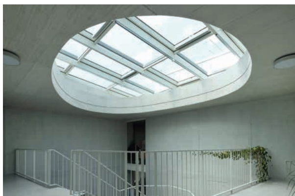
VENTRIA 3 flap as a ventilation flap in a mono-pitch roof