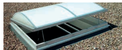
VARIO light flap with SHEV device and electrical motor in ventilation position