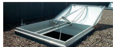
VARIO light flap with SHEV device and electrical motor after SHEV release in the final position